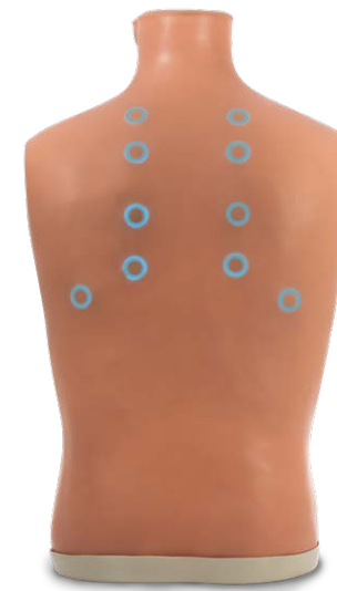
Illuminated auscultation sites.